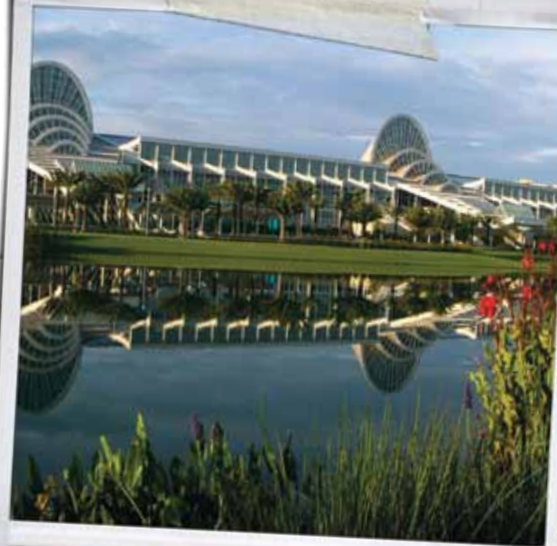
InSites 2009 Outdoor Hospitality Expo ~ Orange County Convention Center ~ 9860 Universal Blvd., Orlando, FL 32819